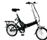
iZip Via Mezza

The Via Mezza features a smaller, foldable frame - perfect for transporting.