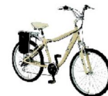
iZip Via Lento

The Via Lento has both "Twist and Go" electric operation and the "Pedal Assist System" as well. You can let the electric motor power the bicycle, or you can pedal and use the electric as a booster to climb a hill or keep up your speed when you need it. (Men's model in-stock, women's model available to order)