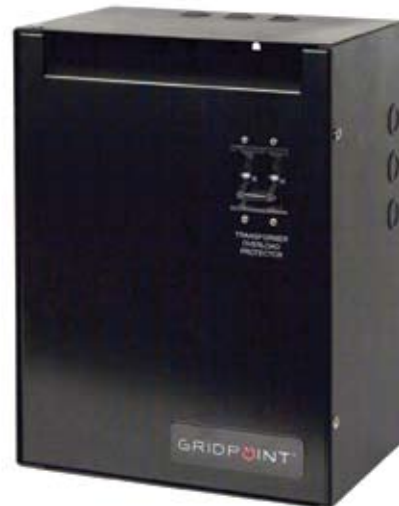
Model No. SPLIT-36-G2