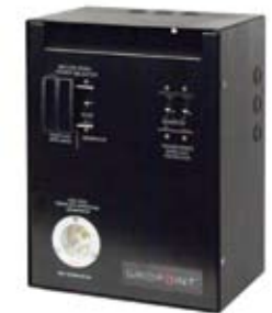
Model No. SPLIT-36-NGI-G2