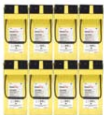
Model No. BATT-10KWH-48V

GridPoint's battery extension solution increases your battery storage capacity, applicable for both Connect and Protect models.