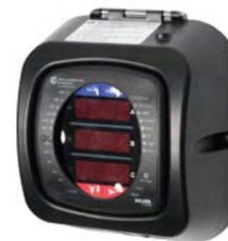
Model No. METER-36-G2